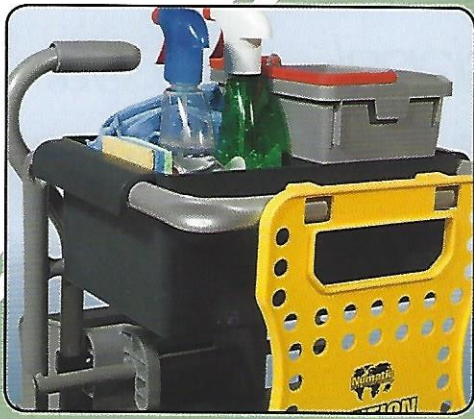
Optional larger tray and pail