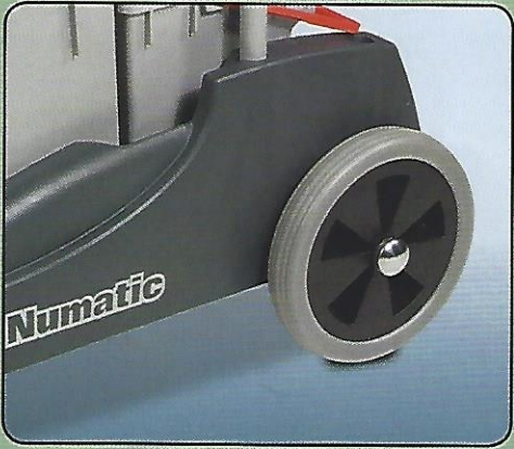
Optional All-Terrain fixed transit wheels