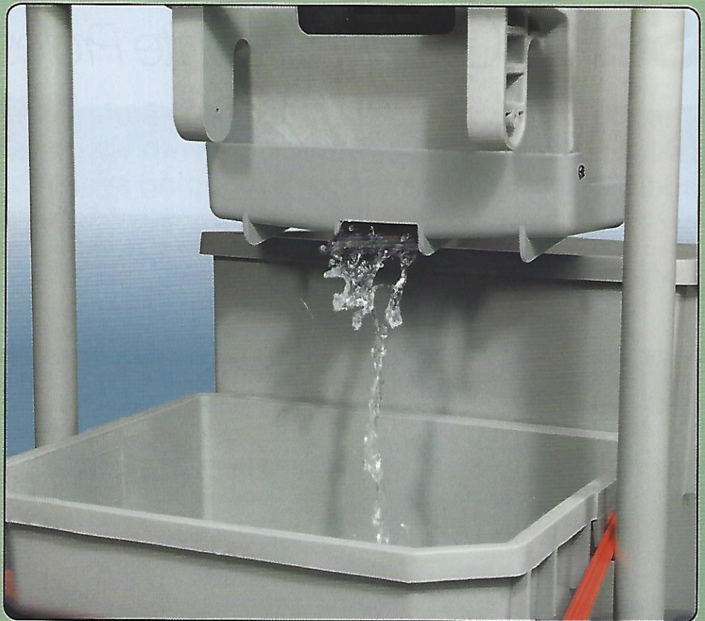
AWS - Automatic Water Separation