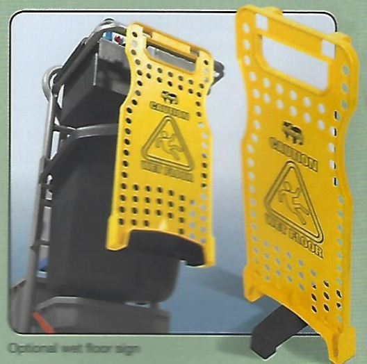
Optional wet floor sign