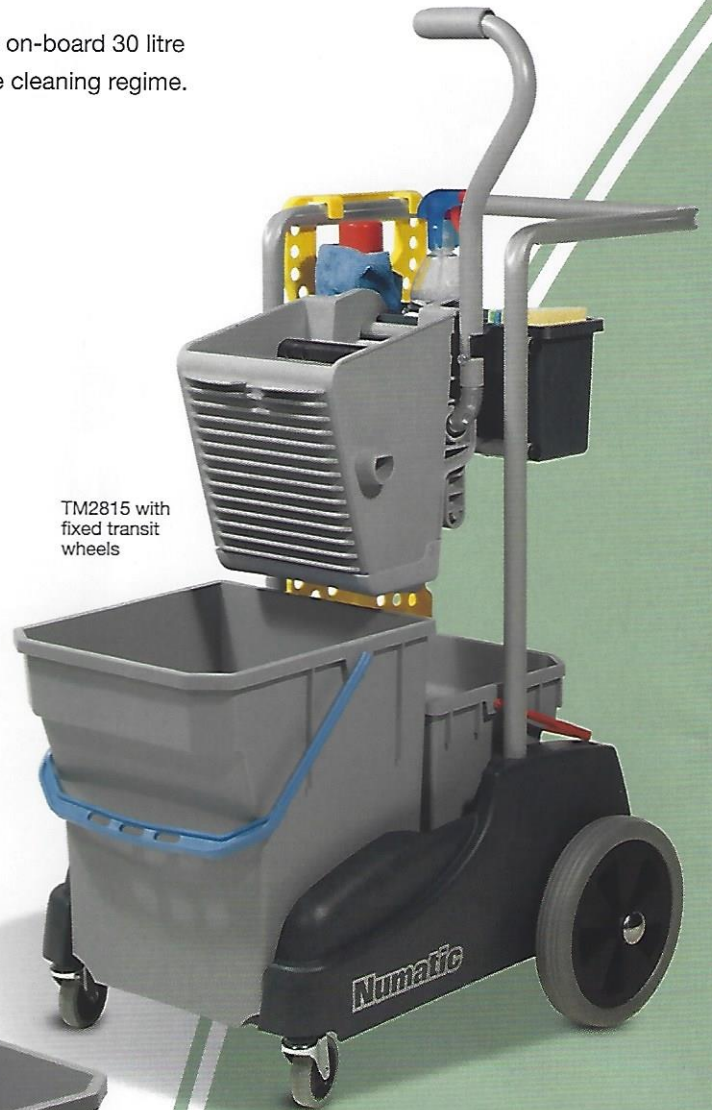
TM2815 with fixed transit wheels